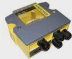
CBX100LT Connection Box