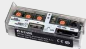
BM100 Backup Module